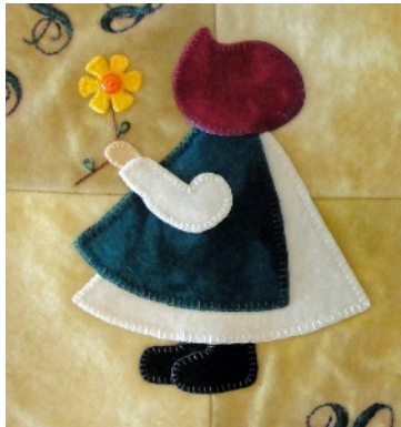
Product Number: 11-8101